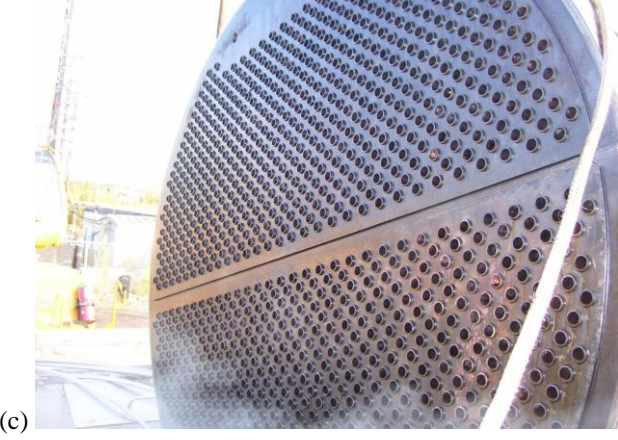
Fig. 2. (a) Large test bundle tube sheet before cleaning. (b) bundle being inspected during the cleaning process. (c) Test bundle after cleaning process.

The second larger bundle, tested in the large vessel had similar results. The bundle was treated for several hours in a proprietary aqueous degreaser with a small amount of solvent, at which point the loosened material began to flow freely from the tubes. Several rinse and re-immersion procedures performed over six hours were sufficient to clean both the ID and OD of this scrap bundle to bare metal, in effect restoring the scrap bundle to fully operational condition. In total, over 1000 kg of foulant was removed from this bundle. Figure 2(a) shows the fouled bundle tube sheet, 2(b) shows the bundle being raised for immersion and Figure 2(c) shows the cleaned bundle.